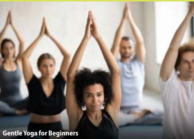
Gentle Yoga for Beginners