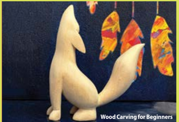
Wood Carving for Beginners