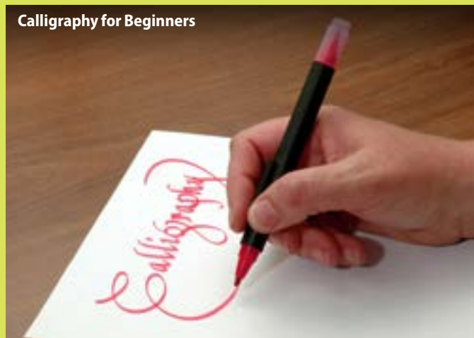
Calligraphy for Beginners