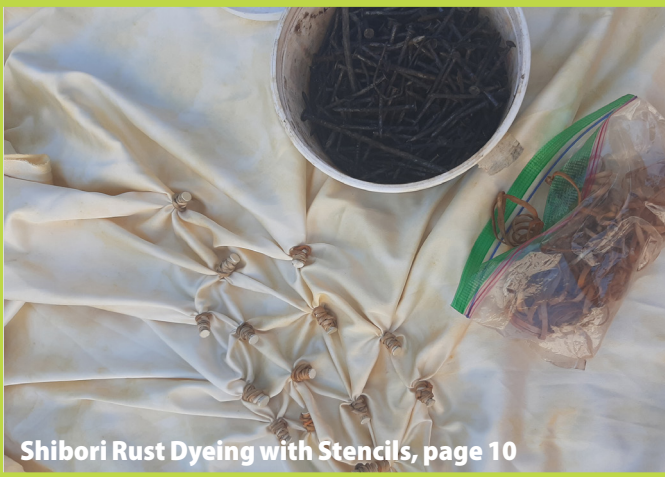
Shibori Rust Dyeing with Stencils, page 10