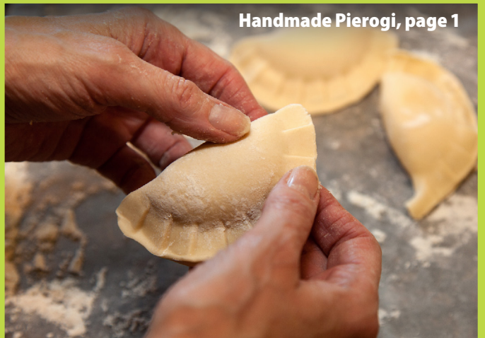
Handmade Pierogi, page 1