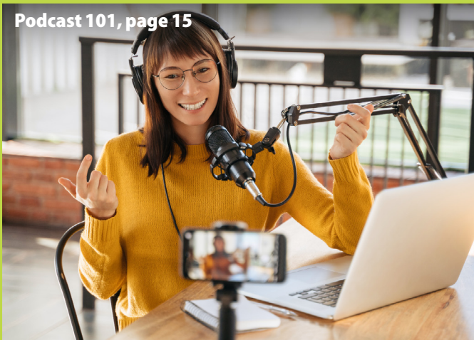
Podcast 101, page 15